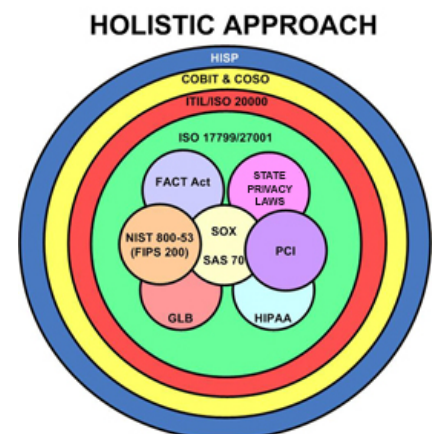
HISP: Holistic Information Security Practitioner